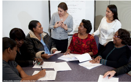
Patient advisors being trained to use the toolkit